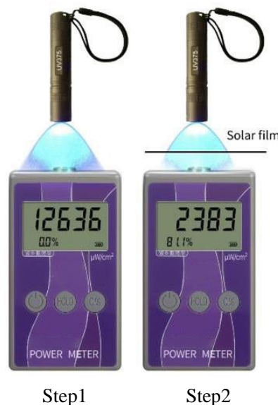
Figure1: Measuring the UV rejection rate of solar film

To measure the UV rejection rate of solar films and insulated glass, etc, two steps shall be carried out: