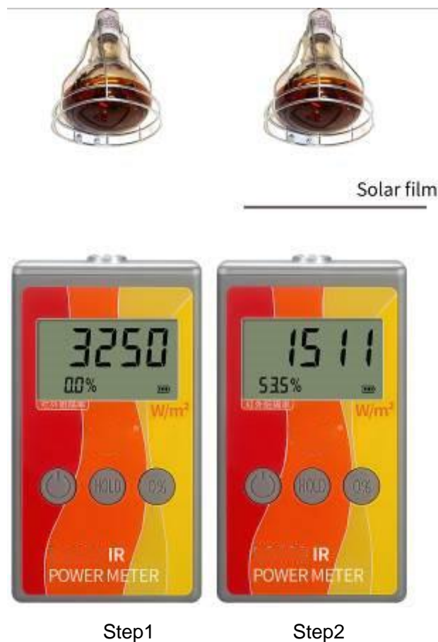
Figure1: Measuring the infrared rejection rate of solar film

To measure the infrared rejection rate of solar films and insulated glass, etc, two steps shall be carried out: