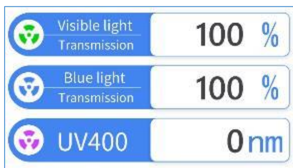
Visible light /blue light transmission+UV400