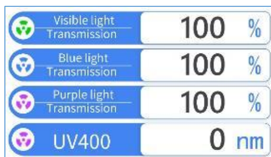
VLT /blue light/purple light transmission+UV400