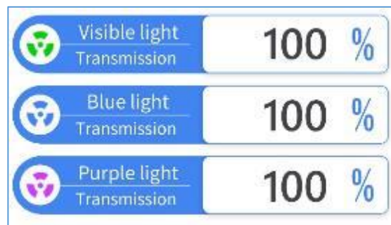
Visible light /blue light /purple light transmission

Select "VLT+BL/UV Rejection+UV400", the measurement interface displays: visible light transmission, blue light rejection, ultraviolet rays rejection, UV400. (Default)