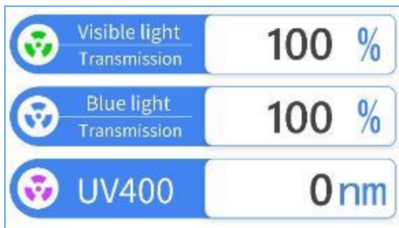
Visible light /blue light transmission+UV400