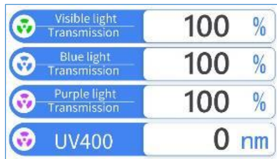
VLT /blue light/purple light transmission+UV400